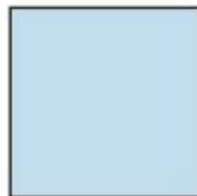
Full Page 10.25" x 10.25"